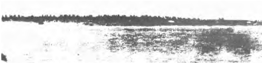
SWAN ISLAND - Shipline view - 1920